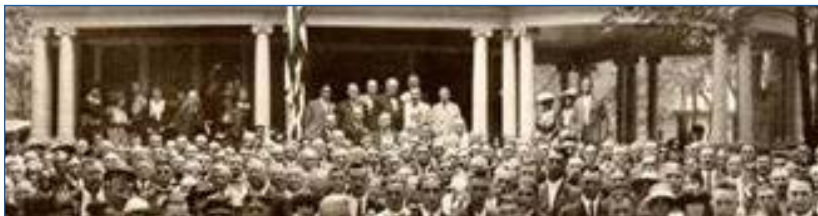
Photo Image of Warren G. Harding Campaign Rally in Front of the Harding Home

To Learn More About the Rich History of Marion Ohio, Please Click on Blue Link Below